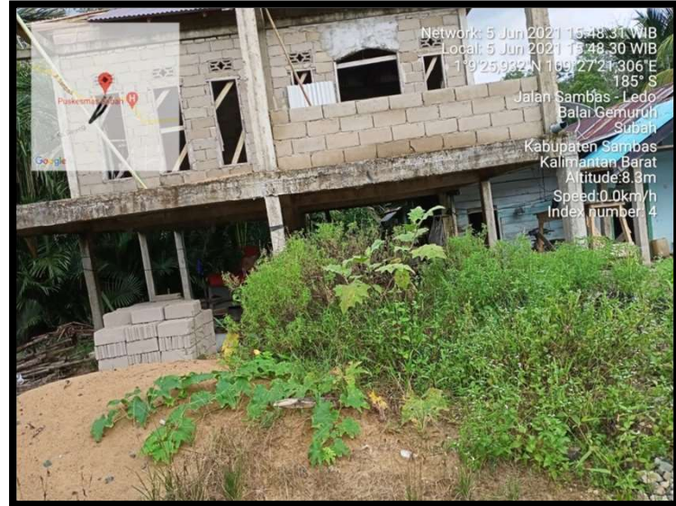
2. Village head's house