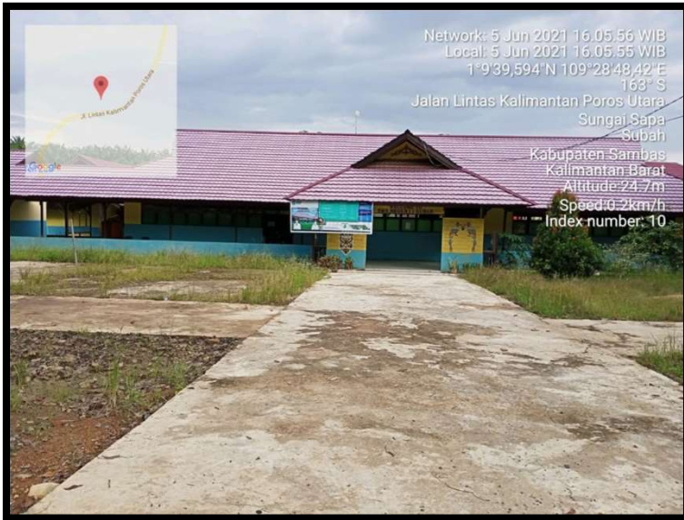
3. Subah High School